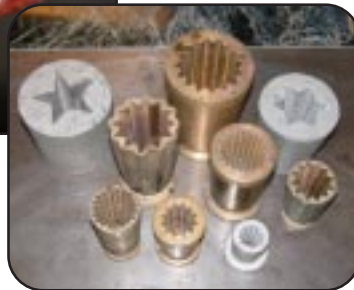
An assortment of Optic molds

1- A gather of red glass is dipped onto the end of a punty and pressed into a 6 pointed star optic mold.