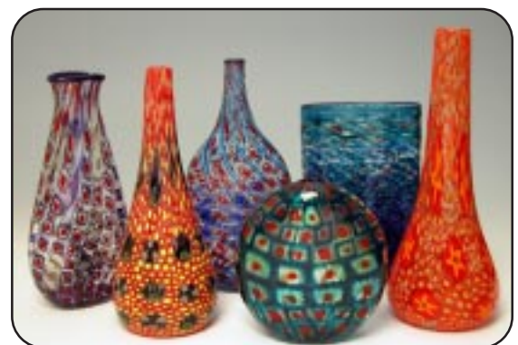
Finished Murrini Vessels

For information on art glass from Gossamer Glass studios, visit us on the web at: www.gossamerglass.com Other tip sheets include #1 Zanfirico Cane, #2 Cane roll-up, #3 Murrini Cane & lay-up, #4 Making a cane goblet. More sheets to follow.